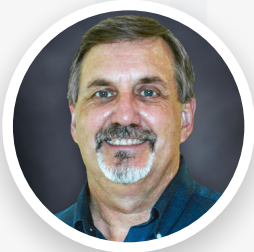
JOHN GAILER NATIONAL DROPOUT PREVENTION CENTER