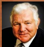
Bill Bennett Author, Radio Host, Former US Sec. of Ed.

National Dropout Prevention Center/Network Georgia Department of Education Georgia Regional Education Service Agencies (RESAs) Communities In Schools of Georgia