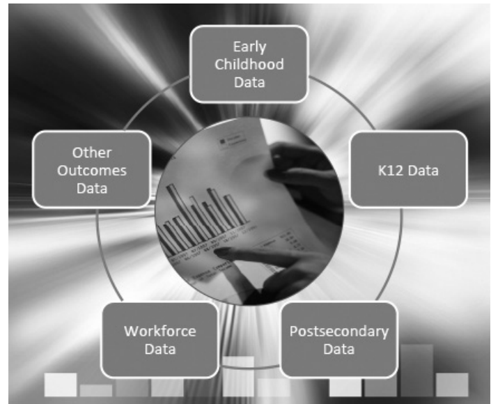
Multiagency data integration facilitates monitoring students' progress longitudinally, P-20W, through various agencies and sectors.

Data across levels of education and across agencies related to various career pathways are not only useful for accountability and program evaluation purposes, but also to better inform other users of such data. These other users include businesses that could not only provide input as to the needs of industry, but could also use the data themselves to better plan for their own futures, knowing the makeup and