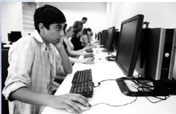
PFT pathways are aligned to CCSS and include authentic, hands-on projects requiring application of those standards. The goal is that students graduate from high school and are both college and career ready.