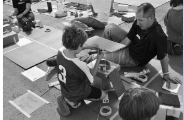
An elementary student in Texas creates a 3-D structure and is introduced to the field of architecture.

Specifically, one district in Texas has also started to make its career development and awareness programs a critical aspect to the strategic plan for its elementary and middle school students. Round Rock Independent School District in northwest Travis County has approximately 45,000 students and it “strives to present its students