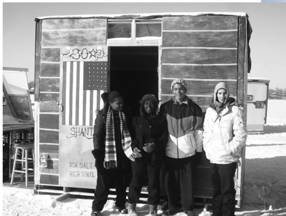
Opportunity High students at the ArtShack.

Through a growing relationship with Communities In Schools of North