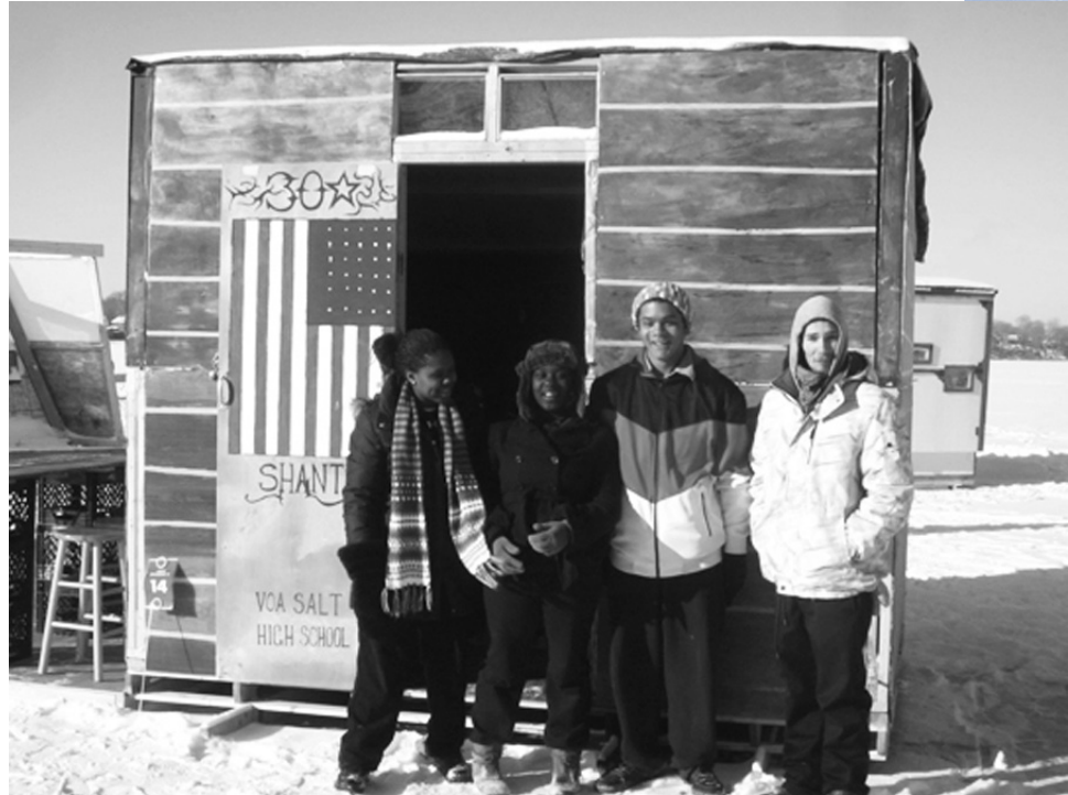
Opportunity High students at the ArtShack.

Through a growing relationship with Communities In Schools of North