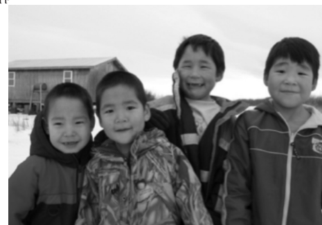
Elementary boys in a remote Alaskan village.