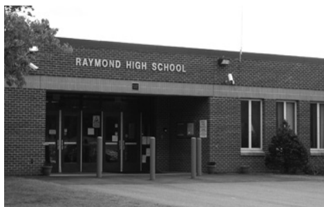
Raymond High School, New Hampshire

Researchers at the NDPC are currently collaborating with colleagues at the University of Louisville on a five-year study, "A Longitudinal Study of the South Carolina Personal Pathways to Success Initiative." The project is funded by a grant from the U.S. Department of Education's Office of Vocational and Adult Education and administered through the National Research Center for Career and Technical Education (NRCCTE). The NDPC project is one of three NRCCTE studies that are intended to increase knowledge about Perkins IV-defined Programs of Study (POS). NDPC researchers are examining South Carolina's Education and Economic Development Act (EEDA), a statewide career-focused school reform model intended to improve student achievement and preparedness for postsecondary education and high-skill, high-wage, and high-demand jobs through a focus on career awareness and exploration and through the creation of locally relevant career pathways and programs of study. Project researchers are studying how eight high schools are implementing EEDA and EEDA's influence on students and POS development. Schools were selected for diversity in the degree of initial levels of policy implementation, local economic conditions, and levels of school and community resources, as well as in size, location, and demographic characteristics of students. Data are being collected from three cohorts of students across the eight schools with different levels of exposure to the EEDA reforms.