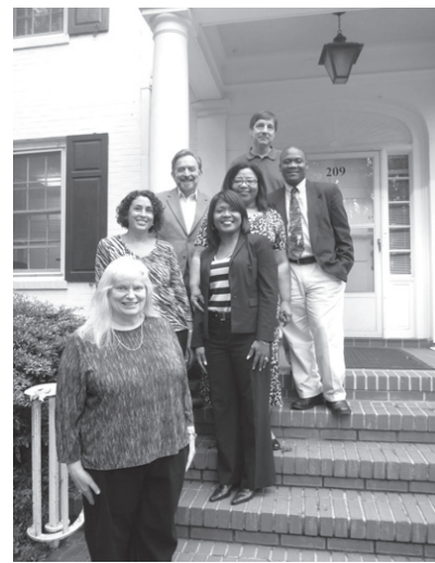
The NDPC-SD staff with OSEP Project Officer Selete Avoke.

In addition, while there is general consensus among educators and policymakers that a “one size fits all” approach is not successful for youth with disabilities at the high school level, the same is also true of reentry programs. Students drop out of school for a variety of reasons, and as young adults, they typically have multiple needs that must be addressed in order for them to succeed upon their return to school. If students are to be given a real “second chance” at obtaining a high school credential, they must be given a different chance, not merely another chance.