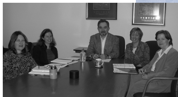
CTE Study Team

For several decades, the Fargo School District had one of the highest graduation rates in the nation. However, a major influx of refugees from all across the globe, particularly Somalia, Bosnia, and Viet Nam, resulted in a significant demographic shift within the Fargo community. The children of these immigrants and refugees were thrust into a school system that was simply not prepared to serve them, resulting in a major decline in achievement scores and graduation rates. Consequently, the Fargo School District Superintendent sought the support of the NDPC to conduct an in-depth analysis of the district's operations. A team of six senior NDPC staff spent several weeks in the school district interviewing all key stakeholders to include students, teachers, administrators, support staff, parents, and key community leaders. A final report was submitted that included some major recommendations that were controversial in nature, such as personnel changes and school redesign suggestions. The school district senior staff and school board studied the findings and recommendations carefully and methodically implemented strategies to address the areas found to be serving as a weak link in the district's educational program. As a result, the Fargo School District has increased its graduation rate by over 15 percentage points and has helped to develop a community-wide approach to addressing the needs of the diverse population it serves.