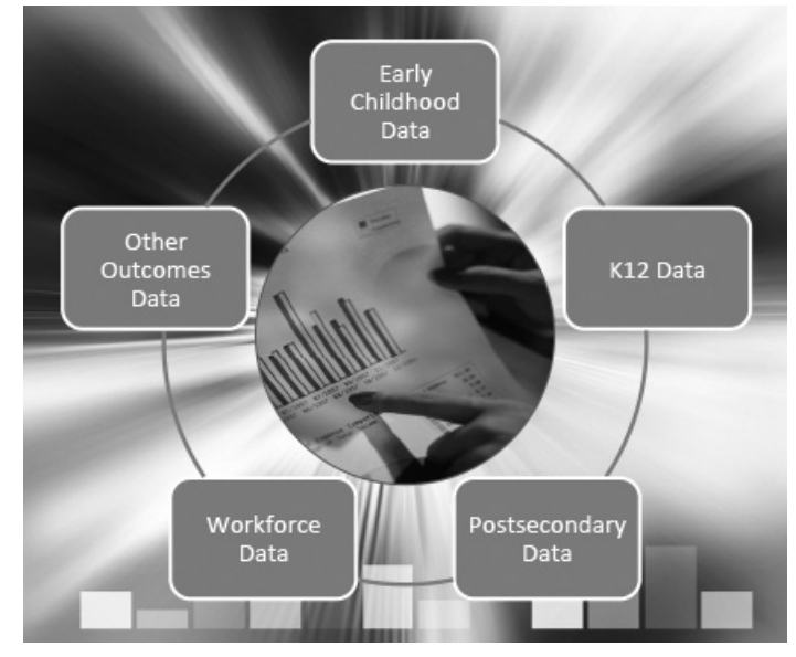
Multiagency data integration facilitates monitoring students' progress longitudinally, P-20W, through various agencies and sectors.

Data across levels of education and across agencies related to various career pathways are not only useful for accountability and program evaluation purposes, but also to better inform other users of such data. These other users include businesses that could not only provide input as to the needs of industry, but could also use the data themselves to better plan for their own futures, knowing the makeup and