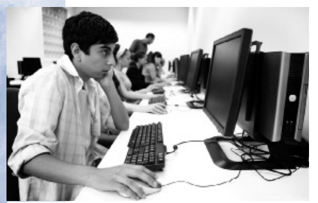
PFT pathways are aligned to CCSS and include authentic, hands-on projects requiring application of those standards. The goal is that students graduate from high school and are both college and career ready.

Career pathways for success will be implemented as a coherent, articulated sequence of four intellectually demanding courses leading to certification or an associate or bachelor's degree. Specifically,