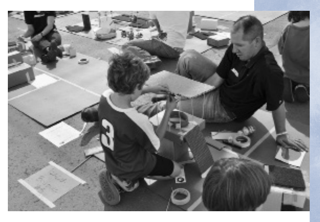
An elementary student in Texas creates a 3-D structure and is introduced to the field of architecture.

Specifically, one district in Texas has also started to make its career development and awareness programs a critical aspect to the strategic plan for its elementary and middle school students. Round Rock Independent School District in northwest Travis County has approximately 45,000 students and it "strives to present its students