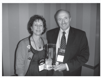
Grossmont Union High School District's Dropout Prevention Program