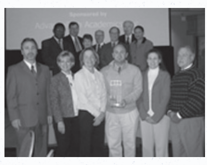
Star Academy Program™

Simon Youth Foundation (SYF) is dedicated to providing at-risk and underserved youth the extra support needed to succeed in their education and throughout their lives. SYF's work is focused on two issues: the national dropout rate and college access. Through its Education Resource Center (ERC) and scholarship programs, SYF is currently celebrating its 10<sup>th</sup> anniversary of service to youth.